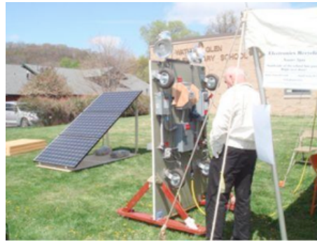
Figure 3. Grid-Tied Photovoltaic Display

A portable, working, grid-tied solar electric array modeled after a system typically installed in a home was built in early 2007. The display includes a photovoltaic (PV) array that is capable of generating 600 watts of electricity. Along with the array, the system also includes an inverter that converts the direct current electricity produced by the solar cells to alternating current electricity that household appliances use. The grid-tied solar electric display also includes educational posters and handouts, in addition to detailed information on incentives available to homeowners who install a grid-tied renewable energy system. The display has been featured at county fairs, Earth Day events and the New York State Fair.