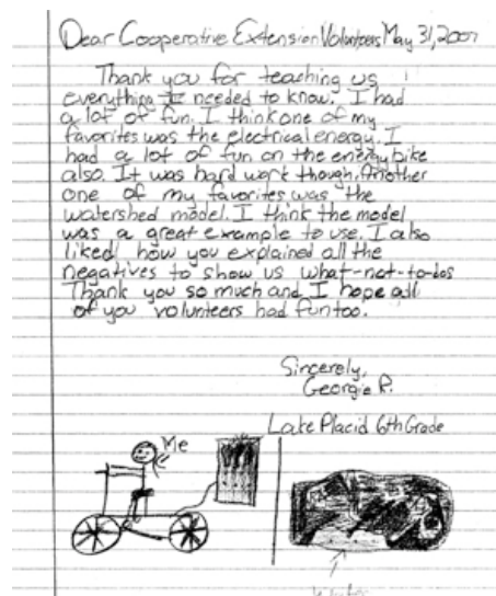
Figure 2. Thank-You Letter

Extension educators have noticed that the Energy Bike has been very effective at communicating a few key pieces of their message, especially with the different amounts of energy necessary to power the light bulbs. Bikers and onlookers can easily comprehend how harder pedaling translates into more lit bulbs. The incandescent bulbs take substantially more work to power up than the compact fluorescent bulbs. The Energy Bike has become a popular feature of county fairs held each summer. It was also highlighted at grade schools across New York State and was especially popular at Environmental Awareness Field day events. 3,742 4th through 6th grade students rode the Energy Bike and learned important lessons at such events between August 1, 2006 and July 31, 2007. A thank-you letter from a participant is shown in Figure 2.