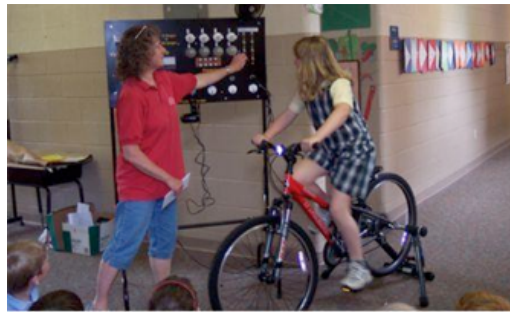
Figure 1. Energy Bike

Extension educators have noticed that the Energy Bike has been very effective at communicating a few key pieces of their message, especially with the different amounts of energy necessary to power the light bulbs. Bikers and onlookers can easily comprehend how harder pedaling translates into more lit bulbs. The incandescent bulbs take substantially more work to power up than the compact fluorescent bulbs. The Energy Bike has become a popular feature of county fairs held each summer. It was also highlighted at grade schools across New York State and was especially popular at Environmental Awareness Field day events. 3,742 4th through 6th grade students rode the Energy Bike and learned important lessons at such events between August 1, 2006 and July 31, 2007. A thank-you letter from a participant is shown in Figure 2.